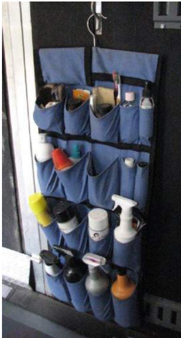
This bottle bag hangs in the Rhinehart horse trailer.

There are a few things that we have noticed that newer drivers forget consistently or don't realize that they may need at DDC drives. Besides the obvious like the horse, the harness (we have known people who have forgotten their harness), and the vehicle, you will need an equestrian helmet for each driver and passenger, a whip (especially if your horse decides that something is too scary to pass), water bucket and water! There are quite a few places we drive where there is no water near the parking area. Besides, you don't know when your horse will not like the water that is at the facility even if there is some. We have actually started to haul water to the shows we attend as well, as it also is a safeguard against the biohazards of hoses coming into contact with multiple buckets and spreading infections.