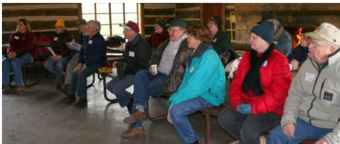
DDC members, many of them new, listened attentively.